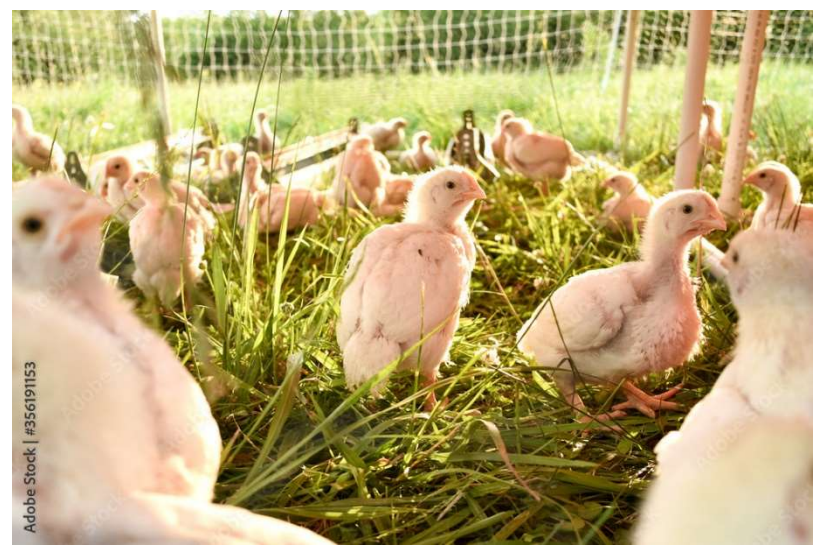
Figure 2. Understanding the interaction between bird health and environmental management is vital for the success of production.

guaranteeing a good work environment for farm employees.